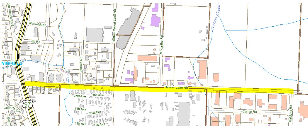
No Load Restriction along Beaver Rd in Lake Country to Kelowna Boundary 70% Load restriction after Kelowna Boundary