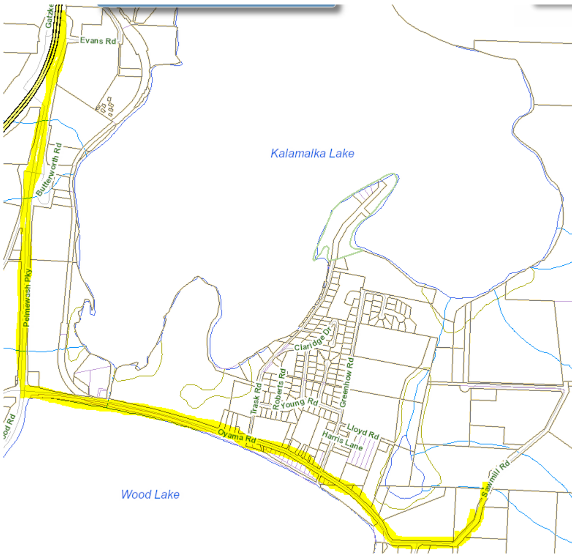
No Road Restriction in Yellow