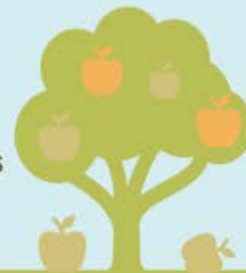
Figure 2. Overview of agriculture within the District of Lake Country (sources: unpublished ALUI report by AGRI, 2014; Statistics Canada Agricultural Census, 2016; and DLC Agricultural Plan community survey, 2019).