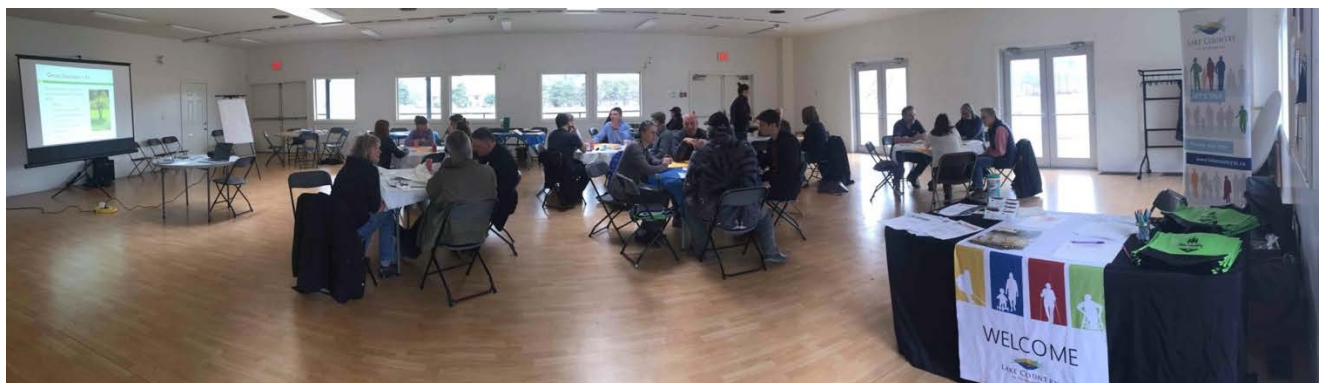
Figure 4. Croportunities workshop in Lake Country, March 2020.